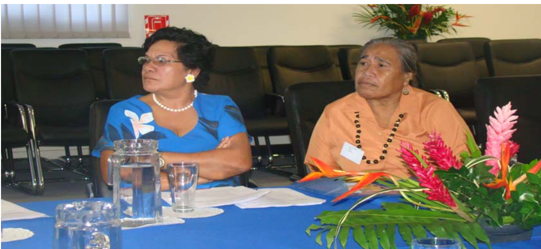
Participants listen to country presentations

Honey, Coffee, Kava, Poultry, Piggery, Small-holder Cocoa Project, Small Holder Fishing, Vegetable / Fruits Farming, Training for farmers, Sea Weed and Rice Planting.