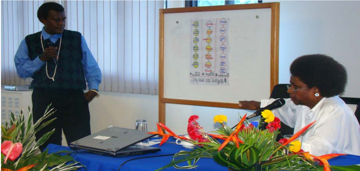
Participants share the Guigvinvanua Economic Model for Peace and Human Security