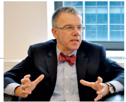
Swiss Ambassador Paul Seger.

To benefit from trade, developing countries must improve their competitiveness and meet the criteria required by international markets. The aid-for-trade initiative aims to support developing countries’ efforts to develop trade capacities. SECO has progressively increased its trade-related cooperation since the beginning of the Doha Round in 2001 and today invests $120 million on trade issues relevant to