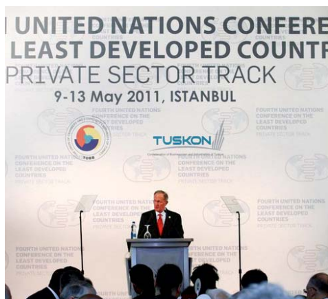
President of the United Nations General Assembly, Joseph Deiss addressing the Fourth UN Conference on Least Developed Countries in Istanbul, Turkey.

18. We reaffirm the critical importance of effective and efficient follow-up and monitoring mechanisms at the national, regional and global levels to assess progress in the implementation of commitments and actions contained in the Programme of Action, including by conducting a high-level comprehensive midterm review. We invite the Secretary-General of the United Nations to ensure that the Istanbul Programme of Action is followed up in an effective, efficient and visible manner. ■