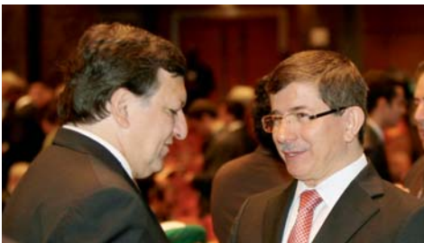
Mr. Jose Manuel Barroso, President of European Commission and Mr. Ahmet Davutoglu, Foreign Minister of Turkey at the 1st Plenary Meeting on the Occasion of the Fourth United Nations Conference on the Least Developed Countries (Istanbul, Turkey 9 May 2011)

Over the course of the five-day conference, delegations reviewed progress made in implementing the Brussels Programme of Action (BPoA) over the last decade, identifying key challenges and setting forth proposals to address them. They called for a renewed and enhanced partnership to help LDCs achieve sustainable development. Many also called for the conference to become a “watershed event” that