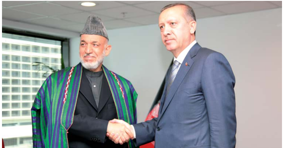
Recep Tayyip Erdogan, Prime Minister of Turkey receives Hamid Karzai, President of Afghanistan at the Fourth United Nations Conference on the Least Developed Countries.

finally enables a large number of LDCs to achieve the conditions for graduation in the next decade. After all, support for the poorest and most vulnerable countries is a moral obligation of the international community, the delegations agreed.