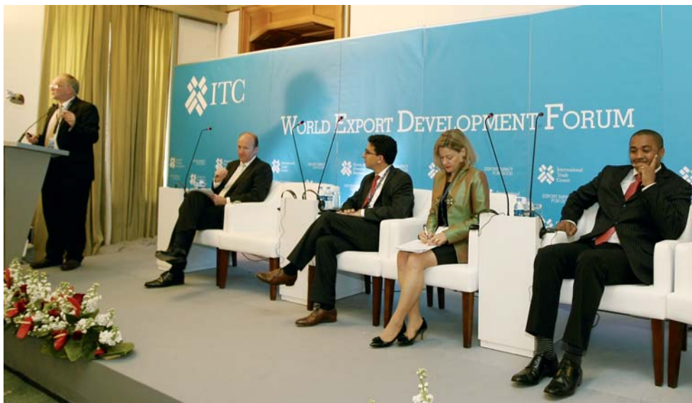
An Event at World Export Development Forum at the Fourth United Nations Conference on the Least Developed Countries in Istanbul.

On the institutional level, capacity-building programmes will be initiated to improve public administration, governance and transparency. More specifically, programmes and projects were announced in investment promotion, tax collection and capital market regulation, social protection, climate change adaptation and mitigation, and strengthening of MSMEs and the private sector, among others.