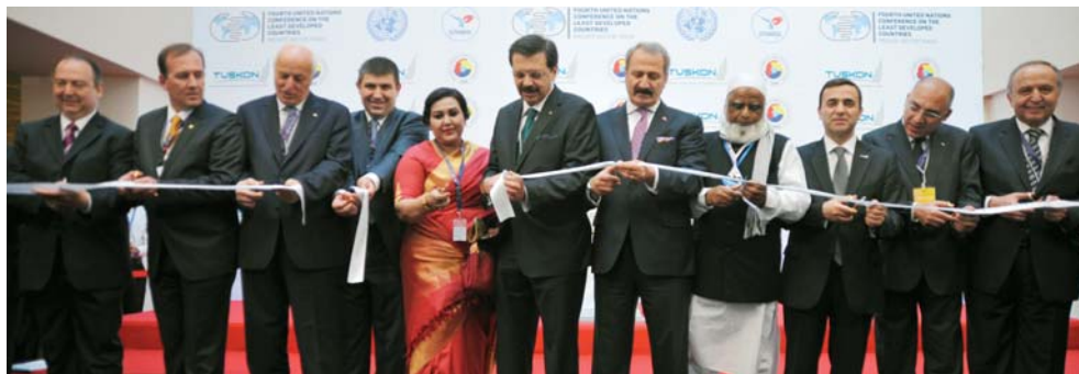
Mehmet Zafer Caglayan, Turkish Foreign Trade Minister at the Trade Fair Ribbon Cutting Ceremony.

Observations and informal reports made during the course of the trade fair indicate that a number of transactions and collaborations are in progress, including import and export opportunities for some LDC products. Companies from non-LDC countries also expressed interest in entering markets in some LDCs (e.g., machinery, materials, construction, and tourism). ■