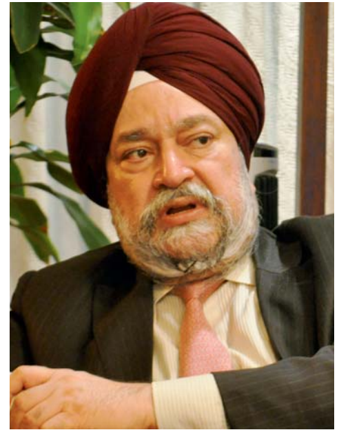
Ambassador Hardeep Singh Puri, Permanent Representative of India to the United Nations.

I believe that the message in Minister Krishna's statement is that this is a moral imperative. I think what needs to be pointed out is that developed countries should help the LDCs not because it's something that should be done, but because it's in their own interest. There is a total of 192 countries in the world with South Sudan joining the international community in the UN to become the 193rd member. If you look at the overall sectoral profile 48 of them are least developed countries, then if you add the landlocked, small island developing states, and you remove the overlapping, that makes it about 90 plus countries. You have all these countries struggling with their development. The future for the remaining 100 can't be that bright, because after all, this is an interdependent, interconnected community of nations. There is an old saying, "poverty anywhere, is a threat to