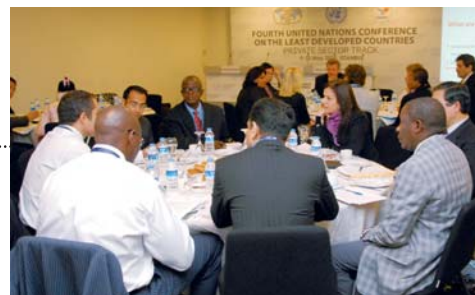
An Event From Private Sector Track Forum at the Fourth United Nations Conference on the Least Developed Countries.

2. HIGH-LEVEL MEETING ON INVESTMENT AND PARTNERSHIPS (MAY 9): A high-level luncheon hosted by the Prime Minister of Turkey that convened Heads of State and Government, chief executives and other top leaders. The event enabled the private sector to