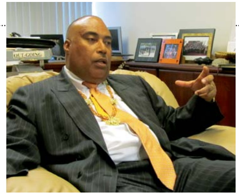
Solomon Islands Ambassador to the United Nations, Colin D. Beck.

We are relocating from some of the low-lying areas right to the mainland, internally. But we're dealing with it internally. Now you must look at it in a framework in which we are doing what we can within our capacity. But over time the land that has been given becomes infertile. Once it becomes infertile where people have relocated, they will have to move into the land of the surrounding populations, and these are triggers of conflict. At the moment we are not talking just sea level rise — we're talking water, food security, biodiversity. We have lost fishing grounds; the problem just grows. The issue for us now is adaptation, which is a temporary solution. It's something that we need to adapt to immediately but we need a long-term solution — we need hope.