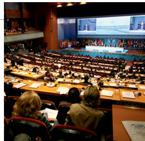
A view of the plenary session inside the Lufti Kirdar Convention Centre at the Fourth UN Conference on Least Developed Countries held in Turkey in May.

least developed countries' development and greater aid effectiveness. We commit to further strengthening our support to least developed countries in creating a favourable environment for sustainable development, increasing productive capacities, the diversification of economies and building necessary infrastructure.