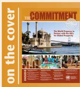
A montage of activities in the LDCs.