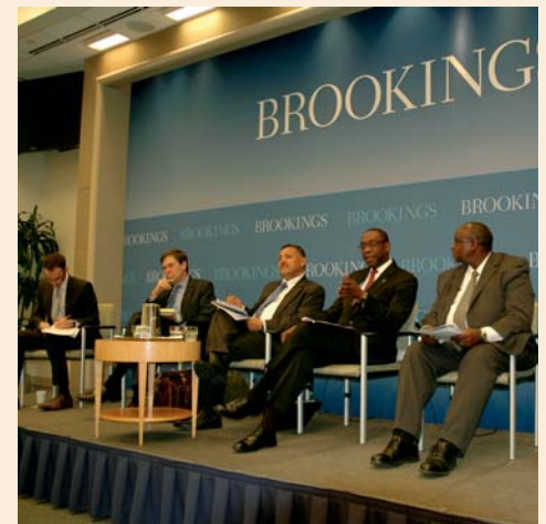
In February the Africa Growth Initiative at Brookings, InterAction and the Center of Concern co-organized a discussion on U.S. and global policy on the Least Developed Countries, with a focus on LDCs in Africa.