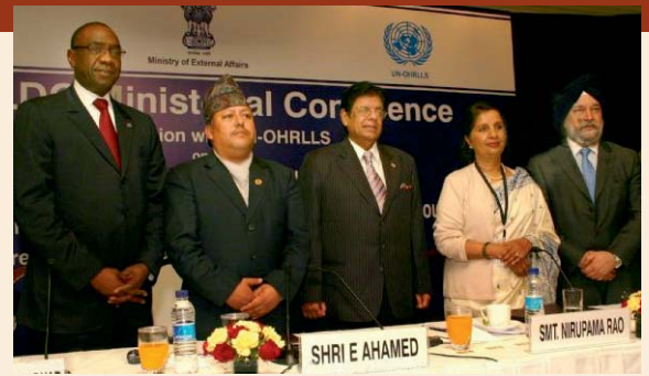
India welcomed LDC delegations for a pre-conference event on ‘Harnessing the Positive Contribution of South-South Cooperation for Development of Least Developed Countries’ in the run up to the Fourth UN Conference on the Least Developed Countries in Istanbul. Cheick Sidi Diarra (extreme left) noted the great potential of South-South cooperation as a “force multiplier” in LDC development.

O n February 18-19, 2011, India welcomed LDC delegations for a pre-conference event on “Harnessing the Positive Contribution of South-South Cooperation for Development of Least Developed Countries” in the run up to the Fourth UN Conference on the Least Developed Countries (LDC-IV) in Istanbul. Hosted by India’s External Affairs Minister and Foreign Secretary, the event enjoyed high-level attendance by several ministers and representatives of the LDCs, the Turkish Minister of Foreign Affairs H.E. Ahmet Davutoğlu, Secretary-General of LDC-IV Cheick Sidi Diarra, and observers from several development partner countries and UN agencies.