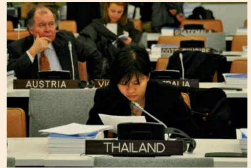
The Intergovernmental Preparatory Committee for the Fourth United Nations Conference on the Least Developed Countries held its first session at United Nations Headquarters in New York earlier this year.

The representative of Turkey briefed the Committee on practical arrangements and