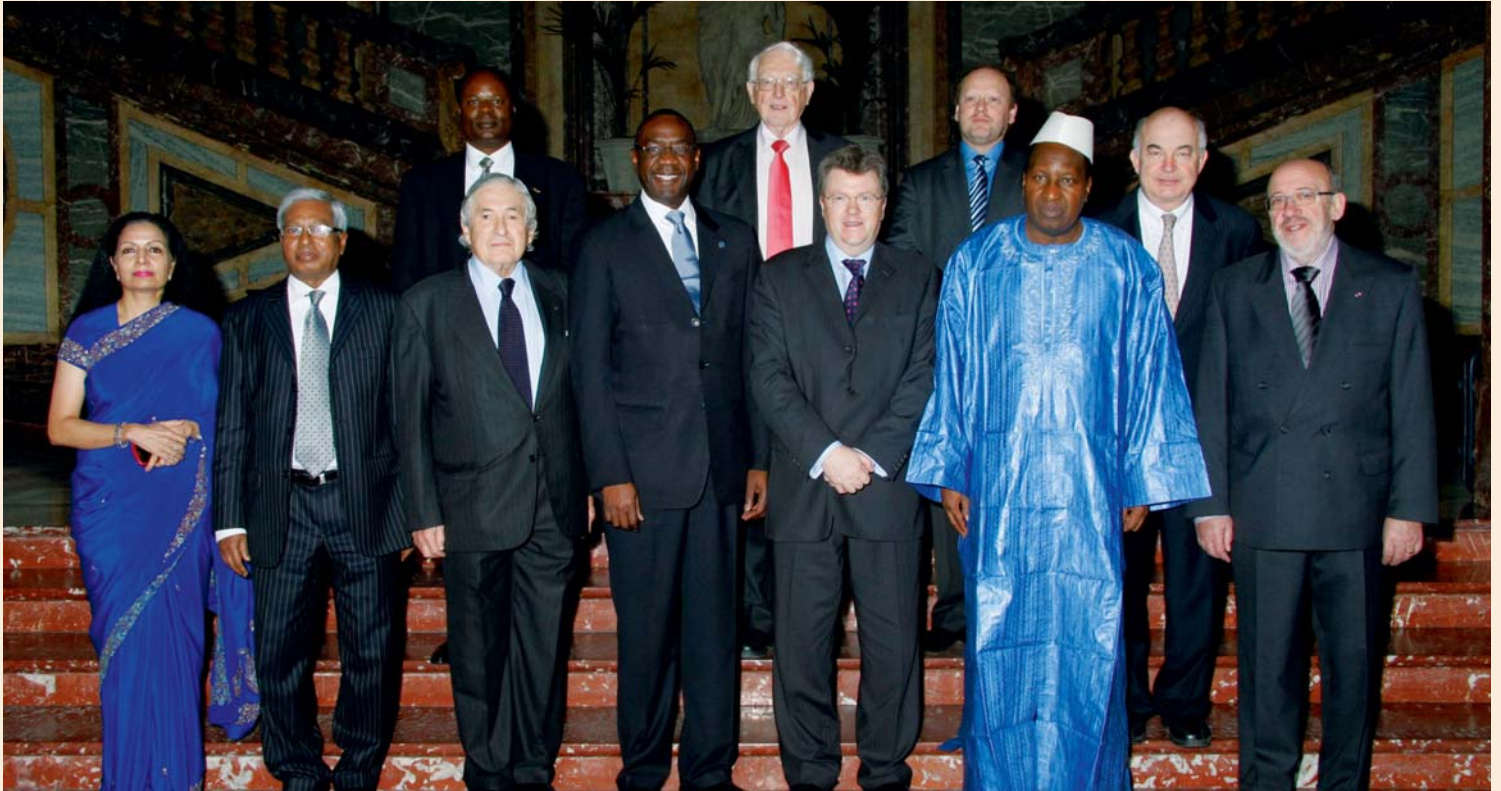
The Government of Belgium generously hosted the second meeting of the Eminent Persons Group in Brussels.

T he Group of Eminent Persons held its second meeting in Belgium to discuss a draft report the Group sent to the Secretary-General of the United Nations Ban Ki-Moon. Organized by the Government of Belgium, the meeting also involved a brainstorm session on the Group's advocacy and communication strategy to ensure the highest level of participation at the Fourth